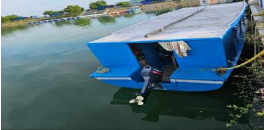
Existing tourism boats