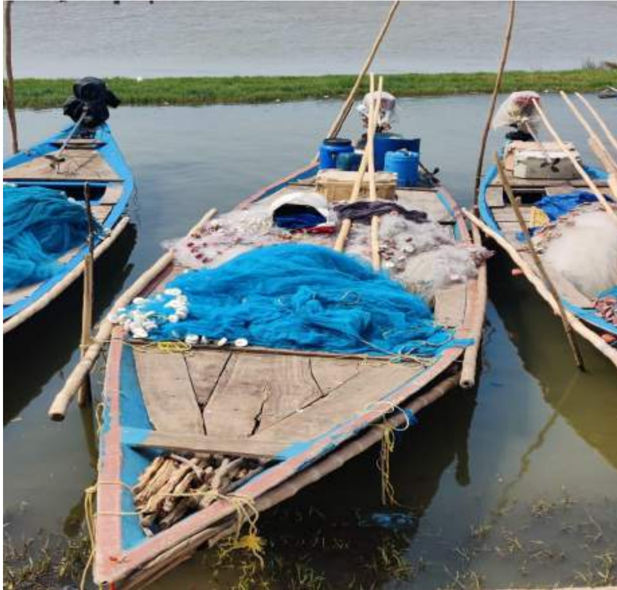
Existing Fishing boats