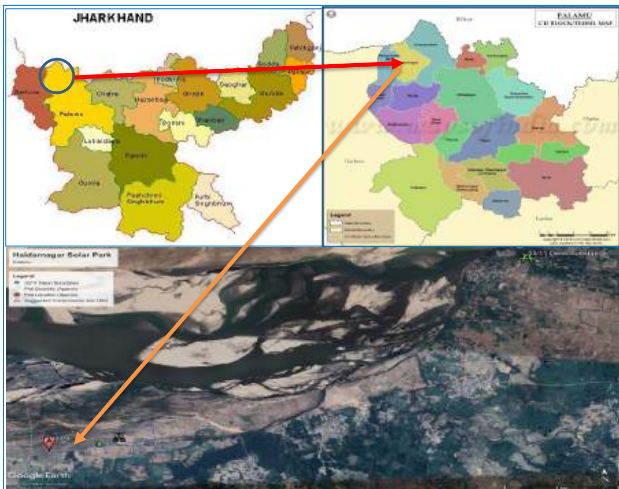
Figure 1 Project Location

The identified Parta site is a piece of land owned by the Government of Jharkhand, located at Haidarnagar, Palamu. Haidarnagr is a village panchayat located in the Palamu district of Jharkhand, India. The latitude 24.5280661, and longitude, 83.9204249 is the geo co-ordinate of the Parta site. Nearest City or Town located near Parta is Palamu around 106 Kilometre and JREDA Office at Ranchi is located around 286 kilometres away from site location.