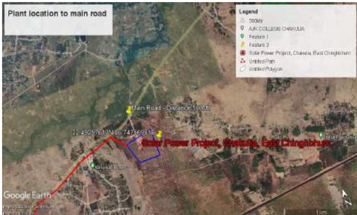
Table 1 Detailed of project site location