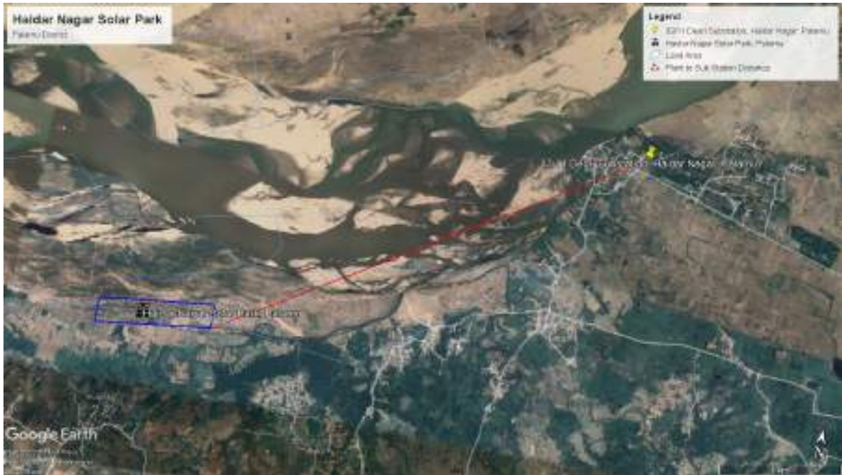
Table 1 Detailed of project site location