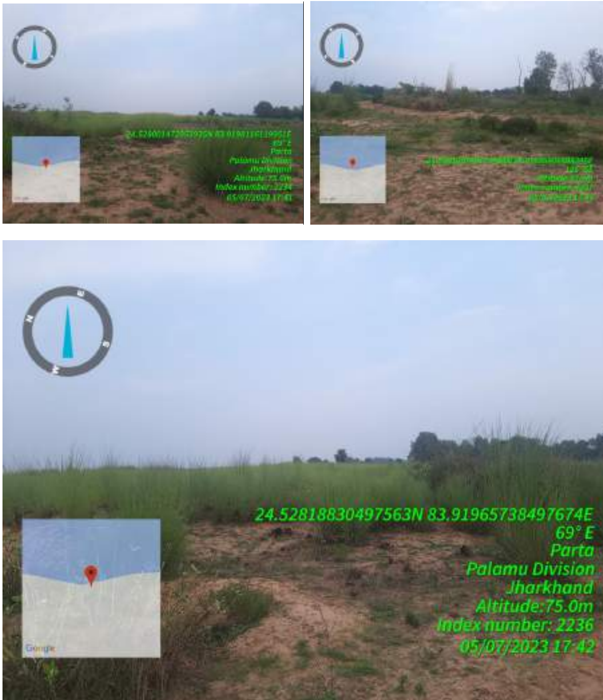
Figure 2 Pictures of Project site