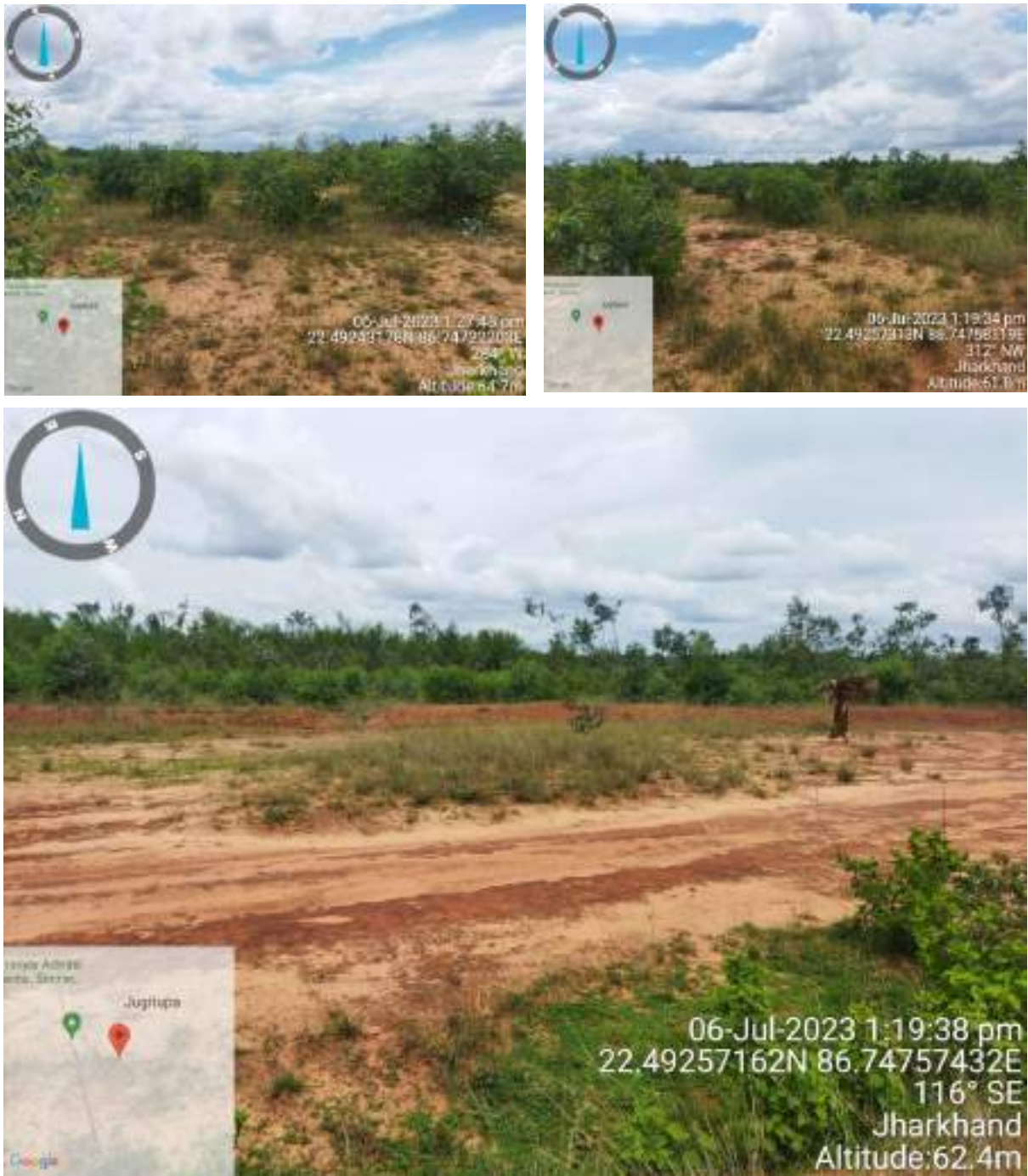
Figure 3 Pictures of Project site